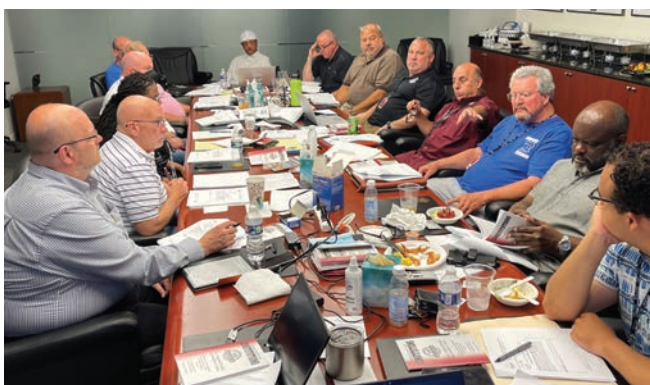
The Constitution Committee meets in Washington DC

All Mail Handlers serving on the separate committees are very proud of the work that they have accomplished and look forward to finally being able to gather for the National Convention. Final written reports from each of these Committees will be distributed, upon registration, to the delegates attending the Convention. After nearly two years of delay, and six years since the last 2016 National Convention, it is certain that all officers, committee members, and delegates are looking forward to a productive and enjoyable week at the 2020 National Convention to be held in Denver, Colorado in August 2022.