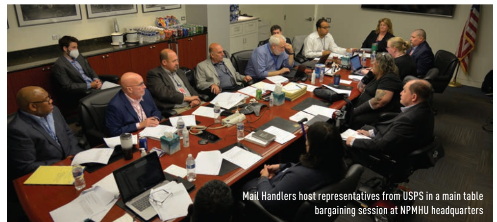
Mail Handlers host representatives from USPS in a main table bargaining session at NPMHU headquarters

Beyond the Main Table bargaining, the NPMHU negotiations team is working hard to resolve and clarify issues in various Subcommittee meetings. These smaller sessions focus on individual topics or discuss proposed changes to a particular article in the National Agreement. Thus far, the NPMHU and USPS have agreed to subcommittees that will focus on issues like Memoranda of Understanding and Letters of Intent (MOUs and LOIs), on Article 11 holidays, and