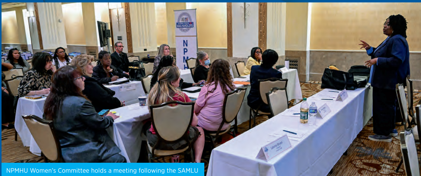
NPMHU Women's Committee holds a meeting following the SAMLU